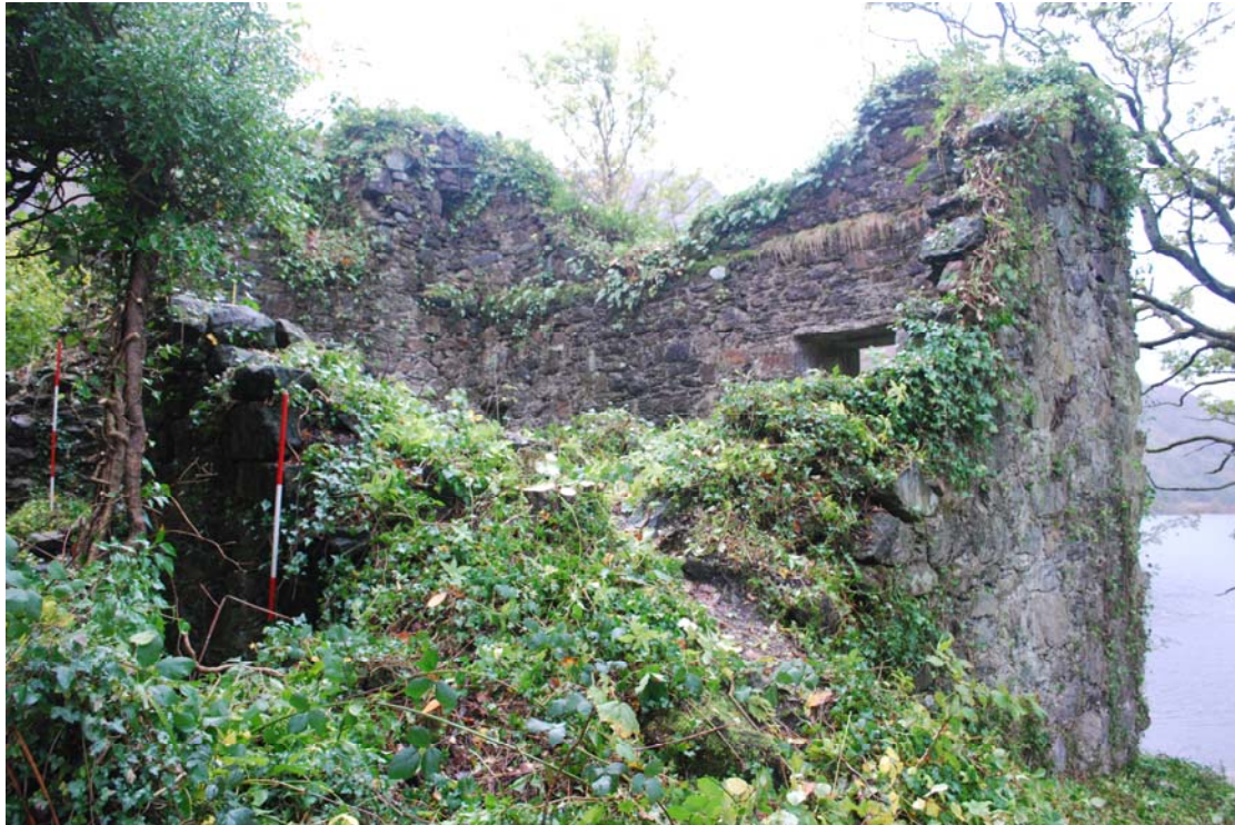
View to the SE, general view of the tower with elm and saplings felled and ivy cut back.