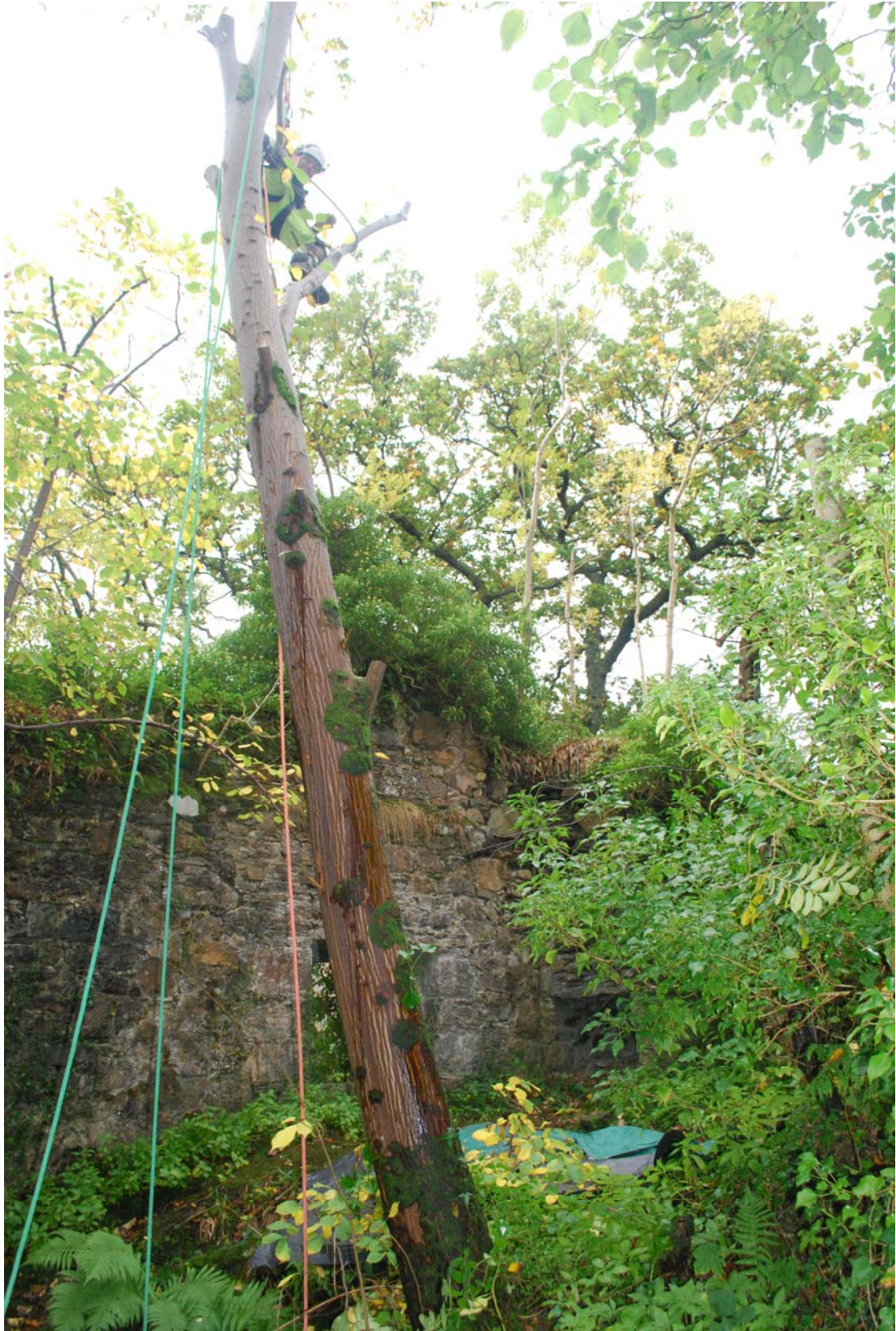
View to the S of limb removal in progress on the Scot's Elm.