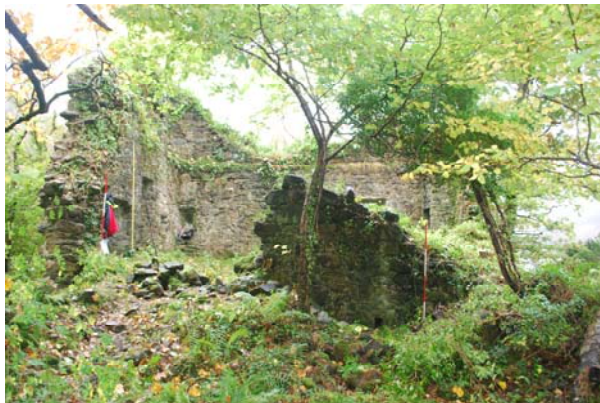
October 2013, the North Wall.