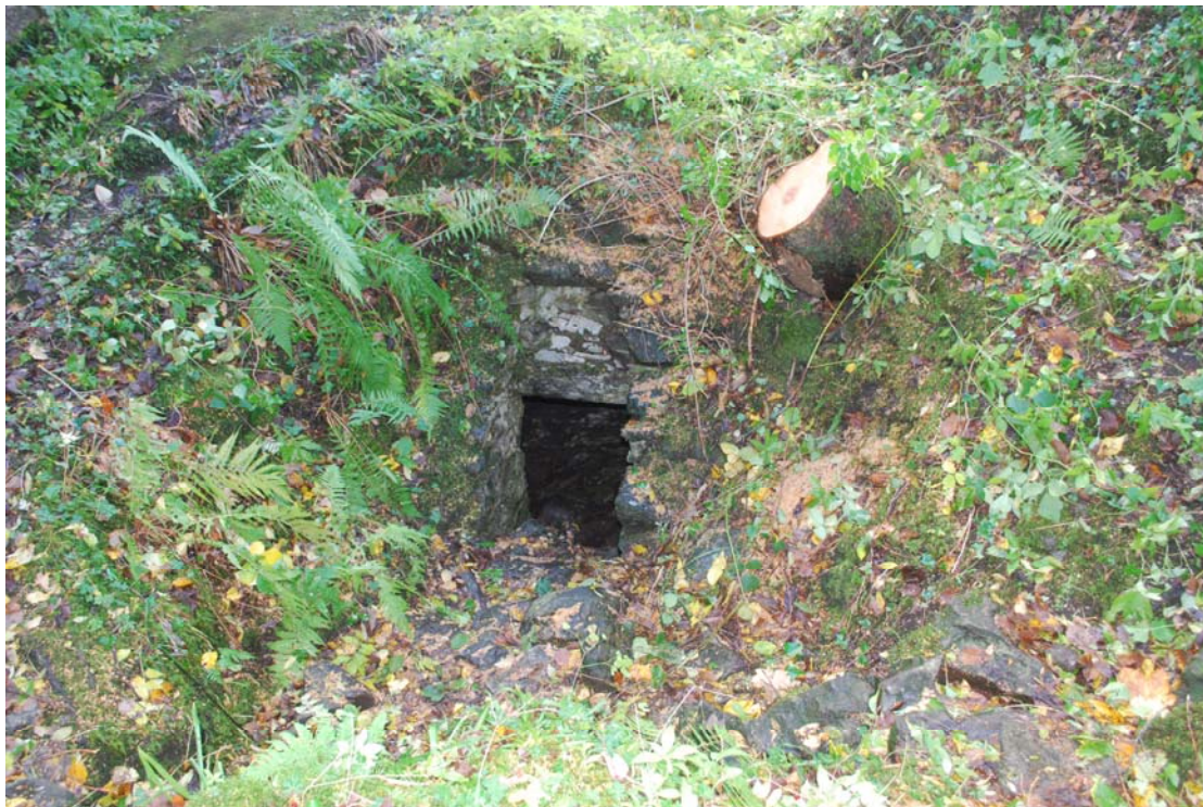
View to W of the entrance to the vault and stump of Scot's Elm after felling.