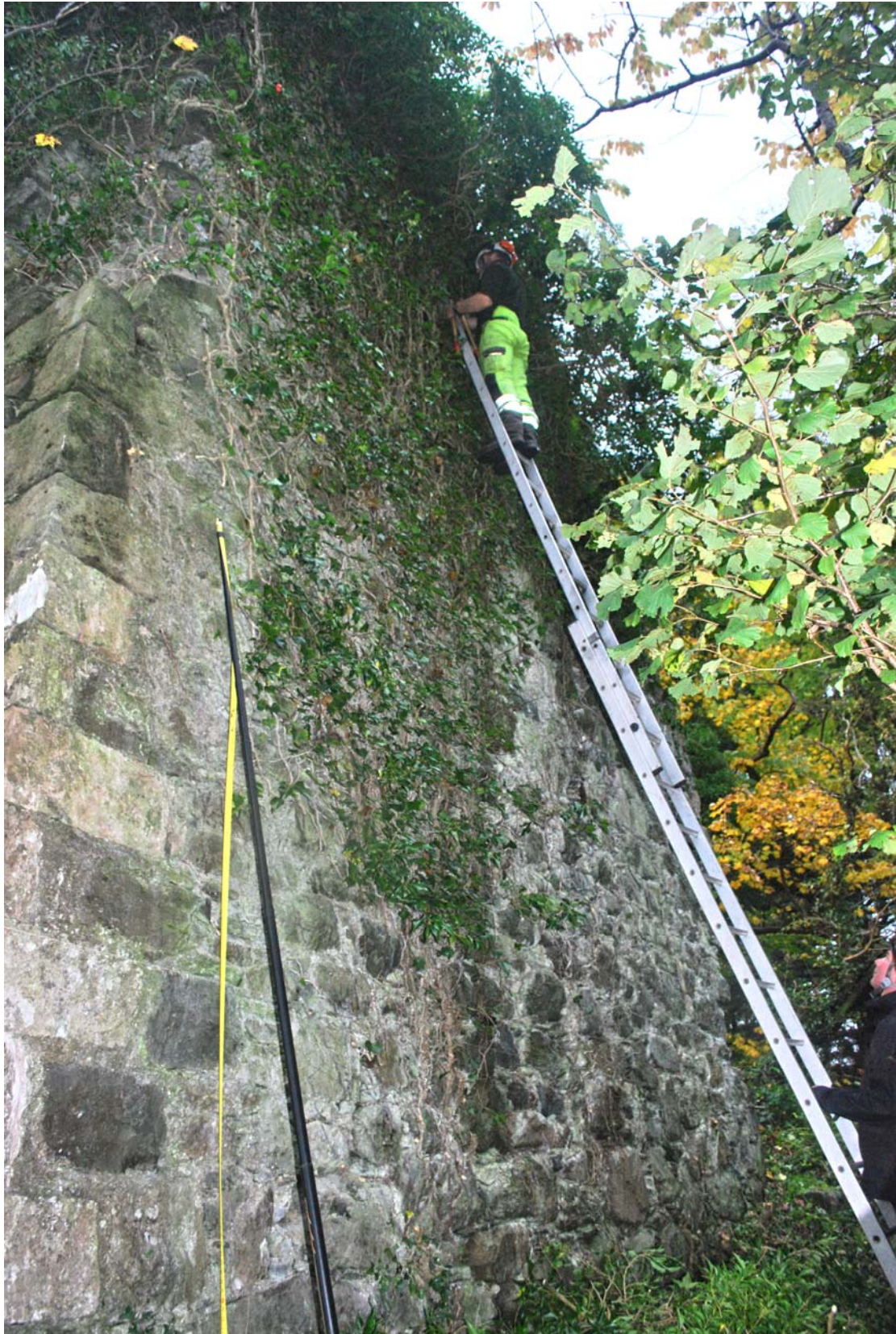
View to NNW, Liam Mackenzie trimming back ivy on the E wall exterior.