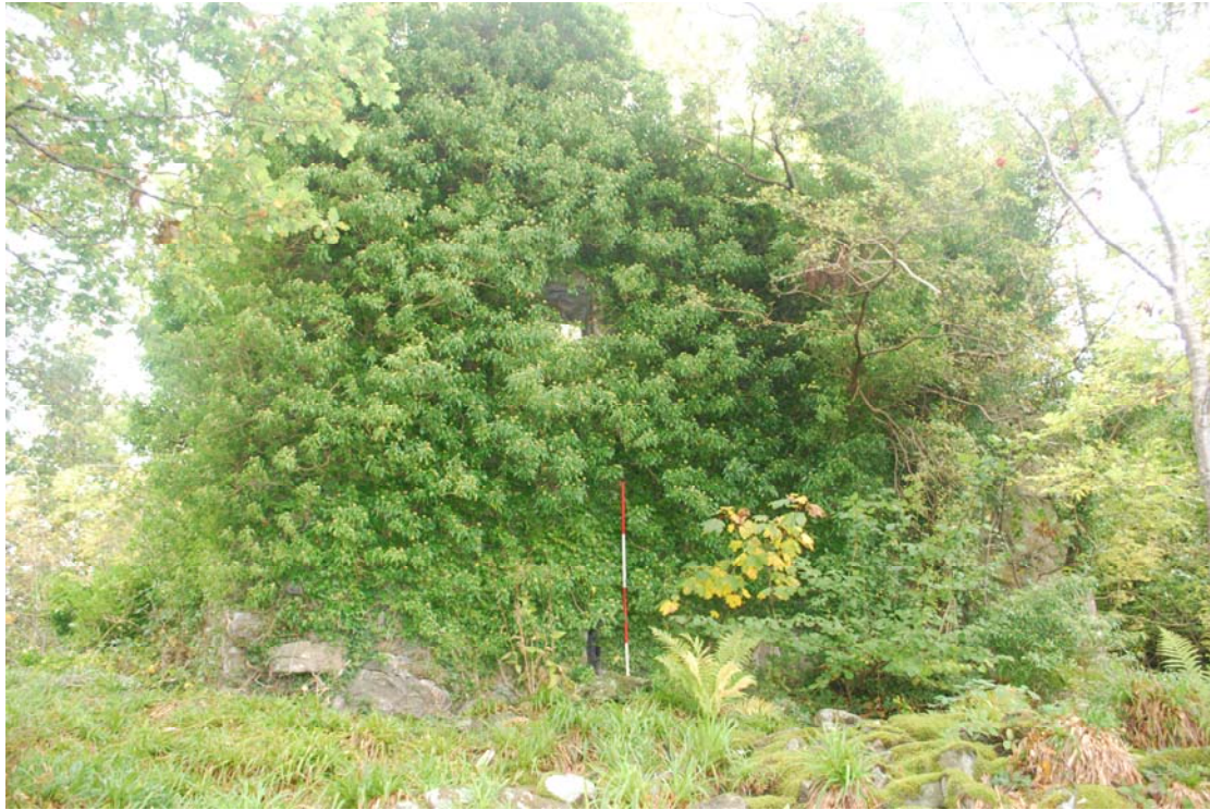
View to NE of the exterior of S wall prior to ivy trimming.