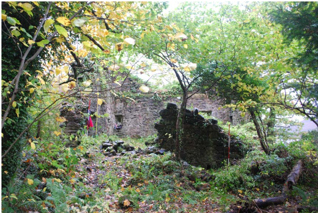
View to the S, North Wall exterior after cutting back of saplings and ivy.