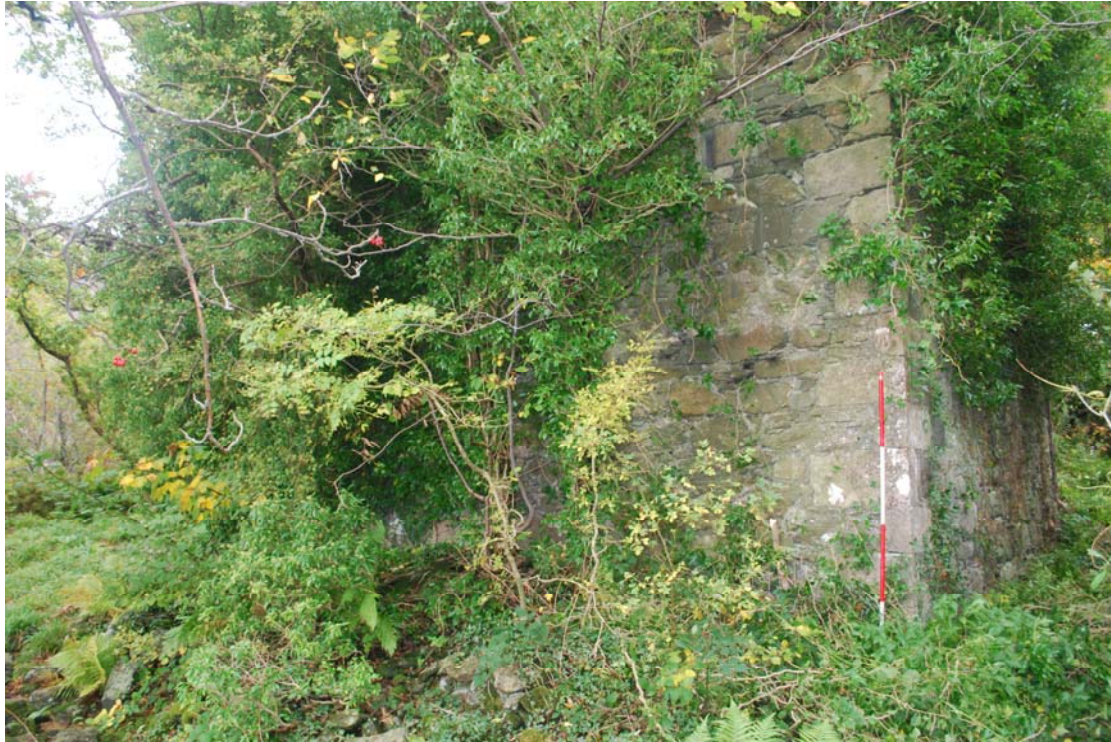
View to NNW of the exterior of S wall prior to ivy trimming.