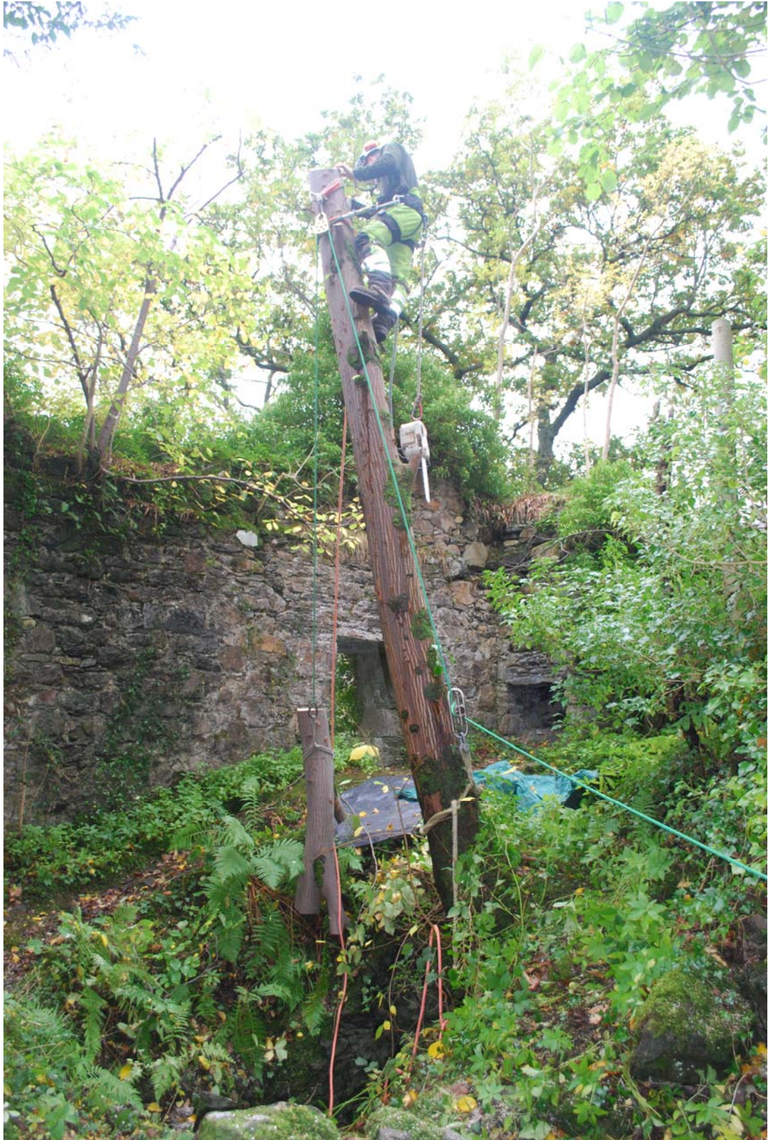
View to the S of sectional felling of the main trunk of the Scot's Elm, Liam MacKenzie in the tree lowering a section of trunk.