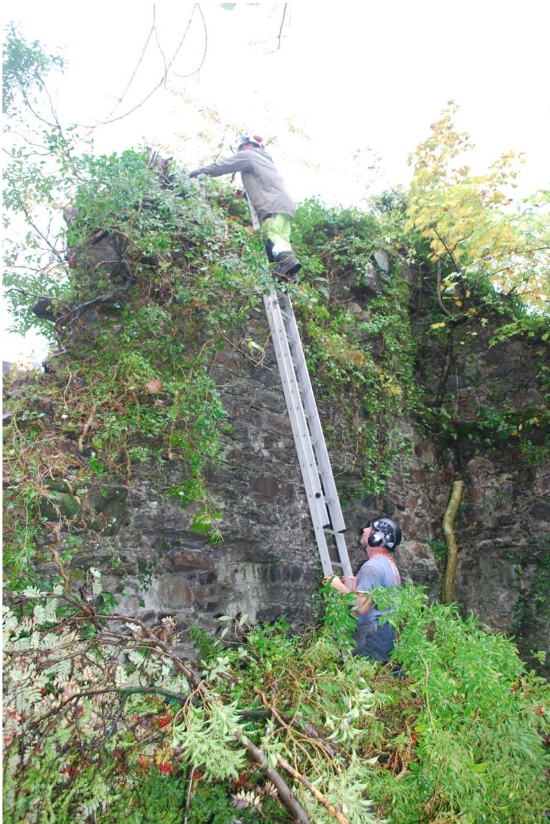
View to SE, felling of saplings on the E wallhead (Liam Mackenzie up ladder and Derek Triplett holding ladder)