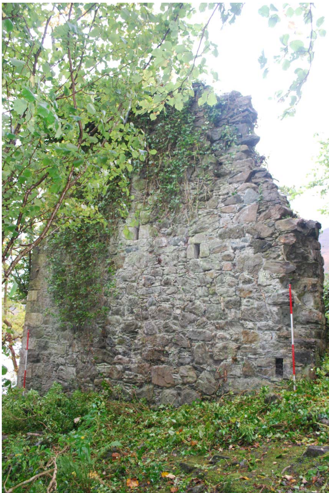
View to W of the exterior of E wall after ivy trimming.