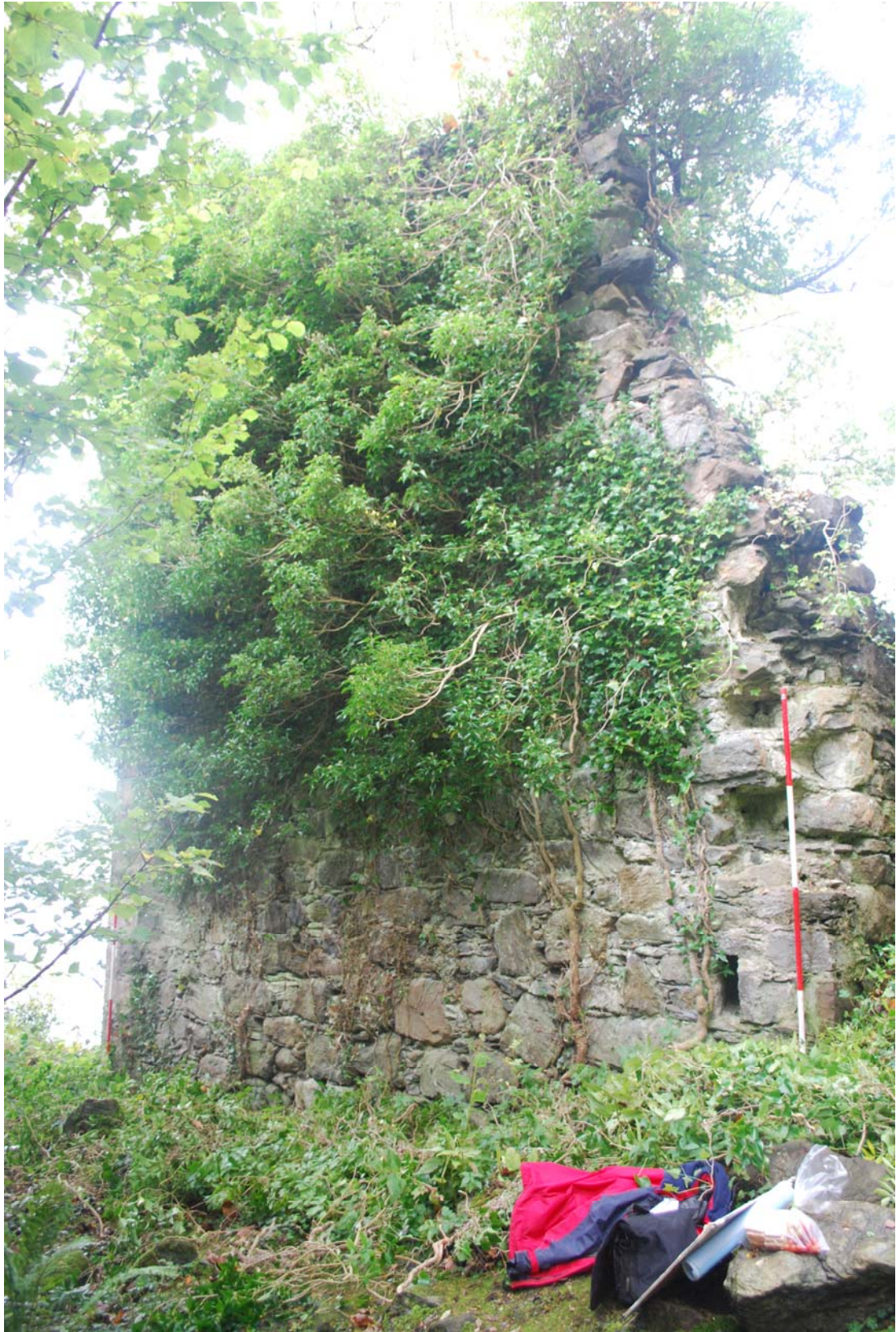
View to W of the exterior of E wall with ivy trimming at bottom 1.5m completed.