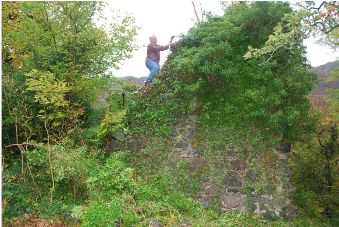
View to E, Bruce McFarlin cutting back ivy from the exterior of the W wall.