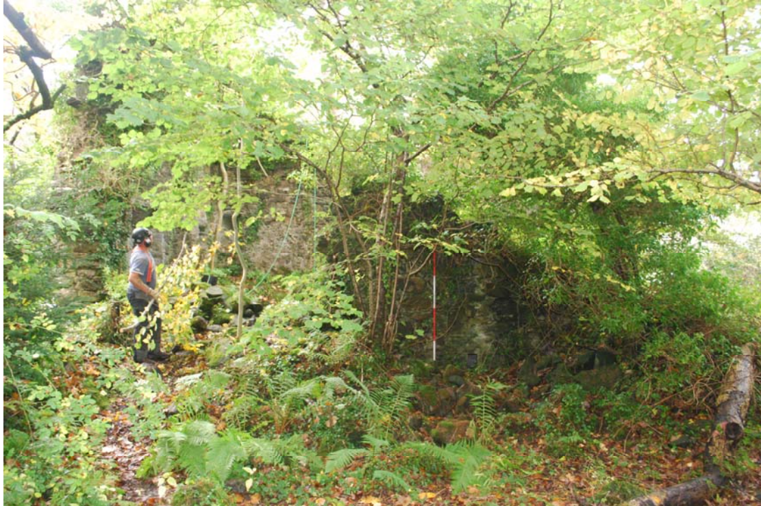
View to the S, North Wall exterior prior to cutting back of saplings and ivy.