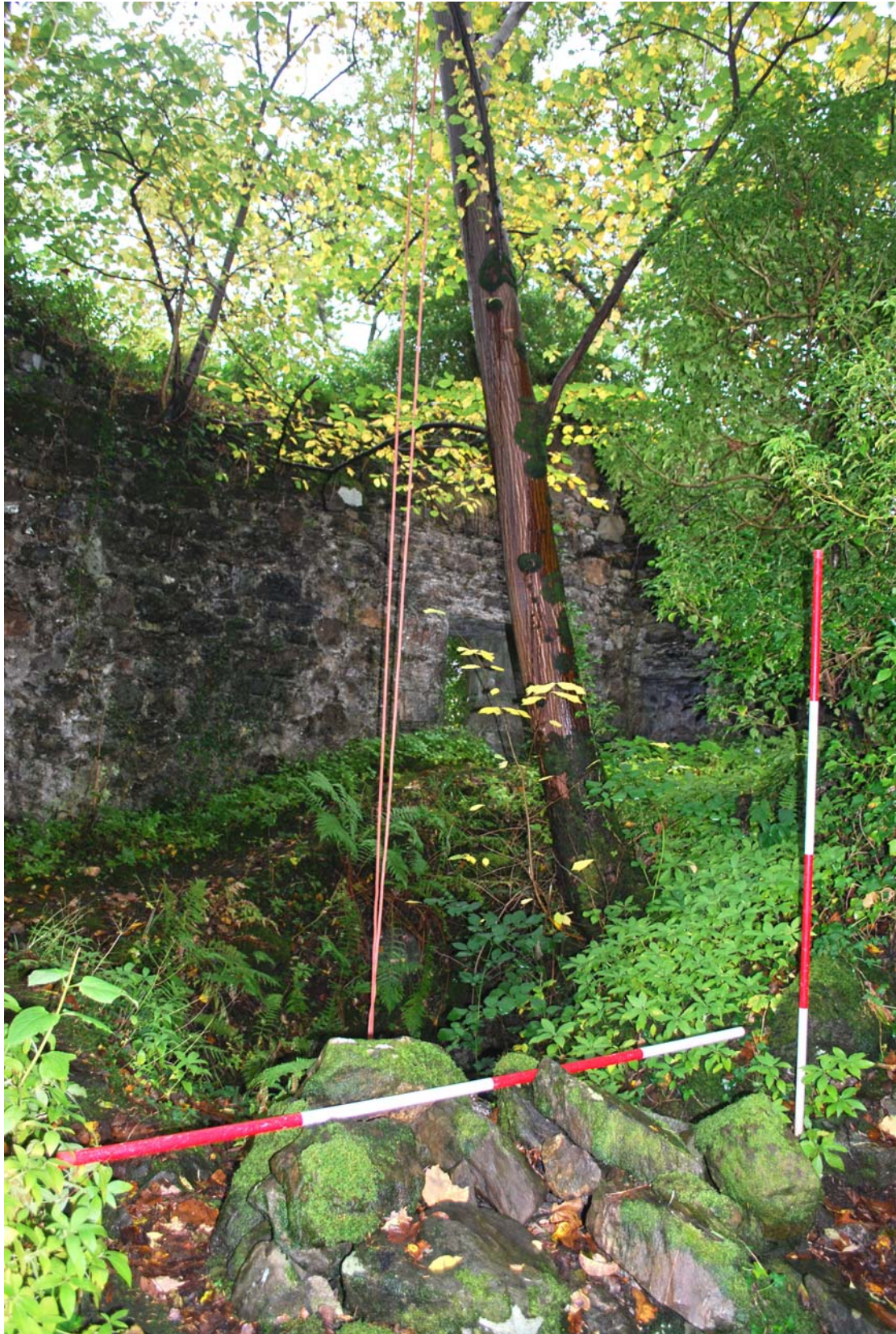
View to SSW of the Scot's Elm growing out of the vault prior to felling.