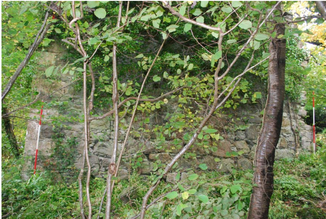
View to W of the exterior of E wall prior to ivy trimming.