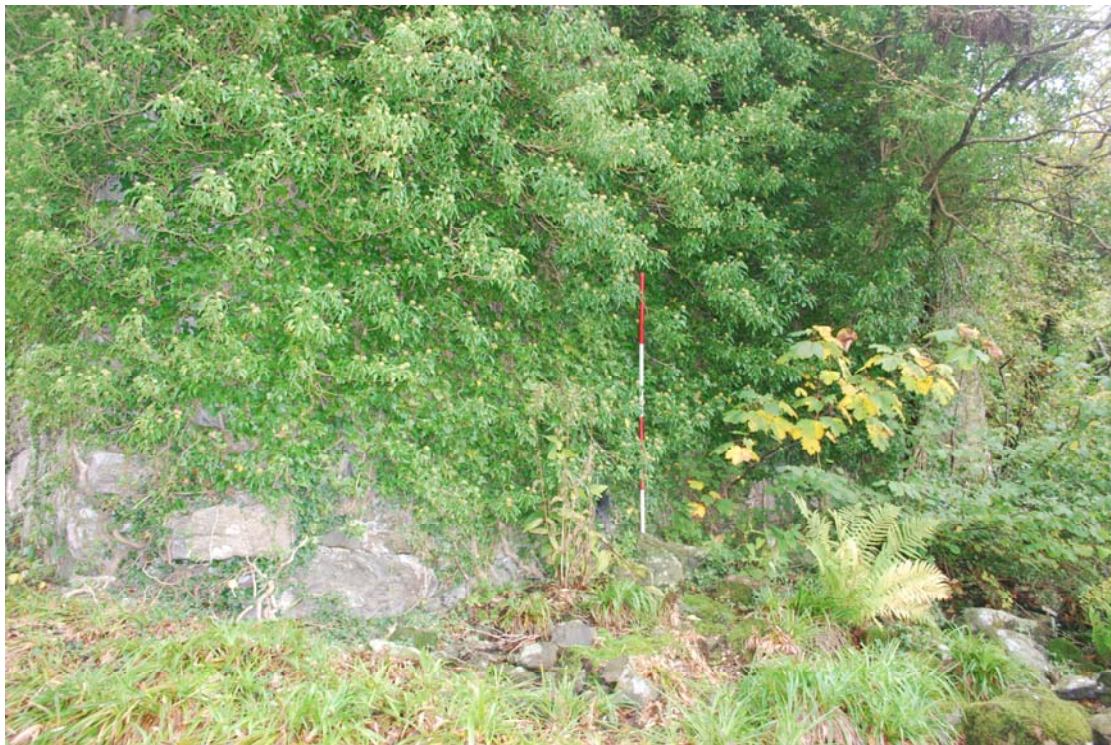
View to E of the exterior of S wall prior to ivy trimming.