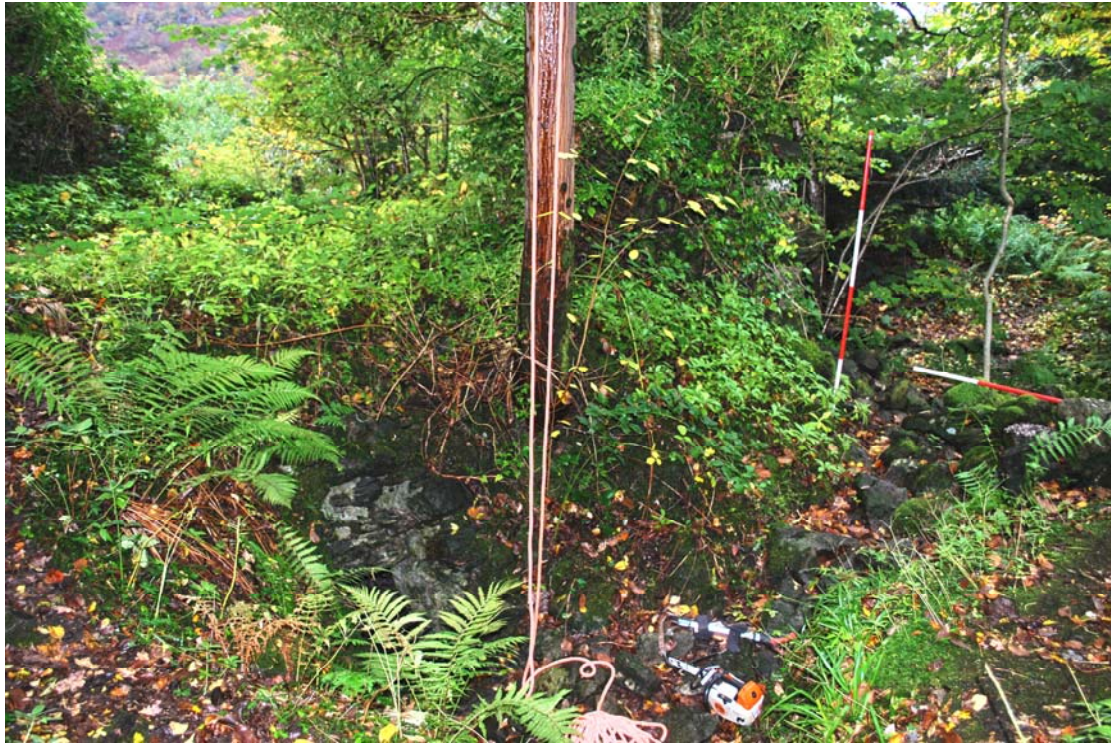
View to WNW of the Scot's Elm growing out of the vault before felling.