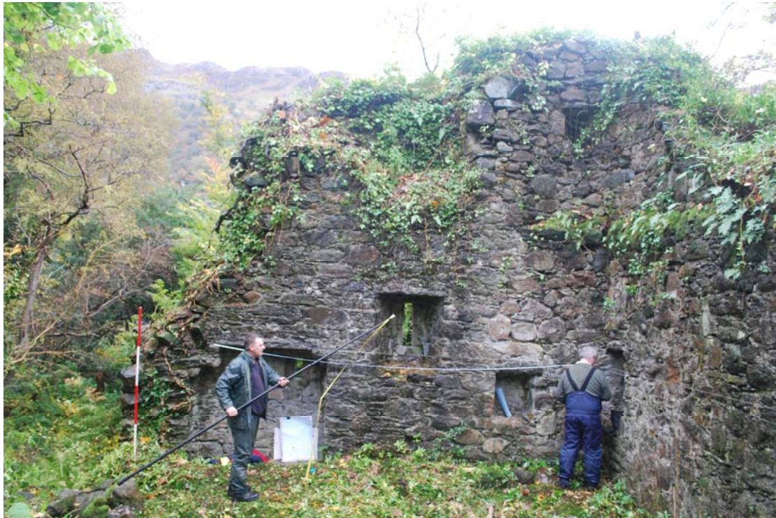
View to the E, David Connolly and Tom Addyman recording the interior elevation of the E wall after elm, ivy and saplings removed. Note vegetation left on the wallheads to help protect the wall core.