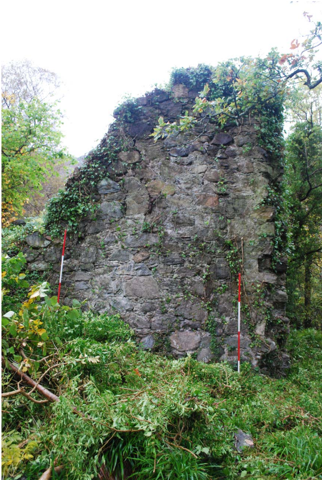
View to the E, the W wall exterior following cutting back of the ivy.