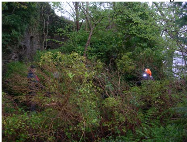
April 2007, the North Wall