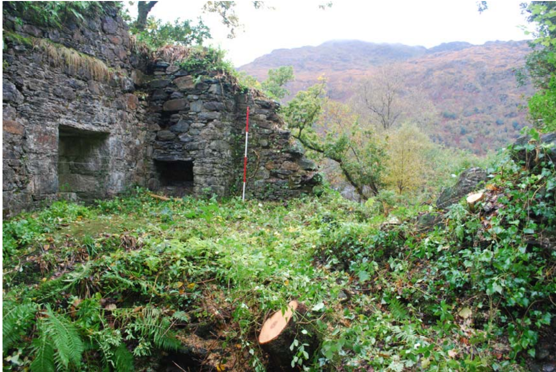
View to the W of the interior of the tower following the felling of the Scot's Elm (tree stump in foreground) and other small trees and saplings.