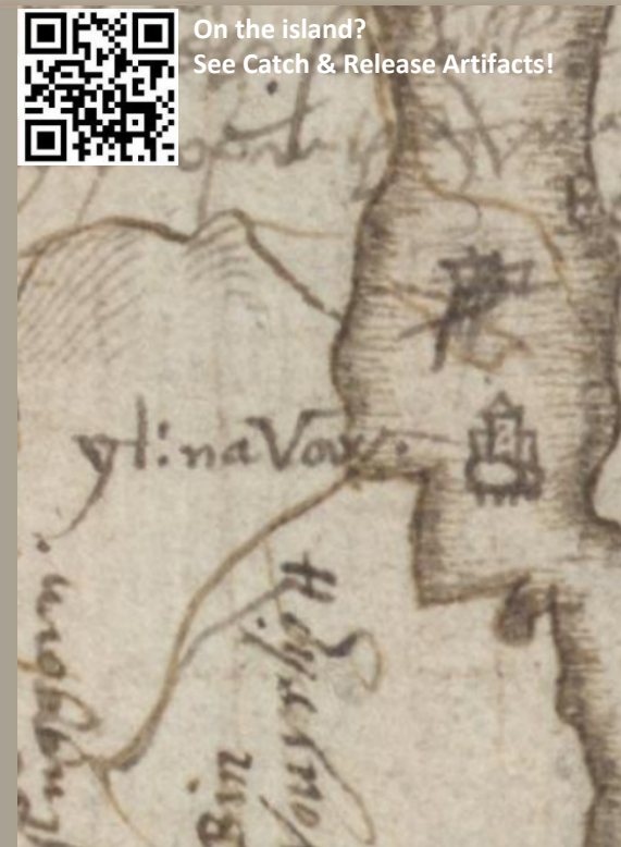
TIMOTHY PONT'S MAP CA. 1590

On the island? See Catch & Release Artifacts!